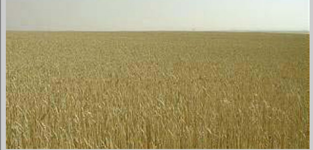
Fields of wheat in all directions as far as the eye can see.

a chance to head out. It's better to have a short, stunted crop of wheat than tall, dead wheatgrass.