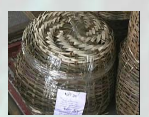
Figure 10. Reed baskets used as export packages do not have an attractive visual appeal.

Several different container types are used for packing bora. Large sacks are often used in the domestic