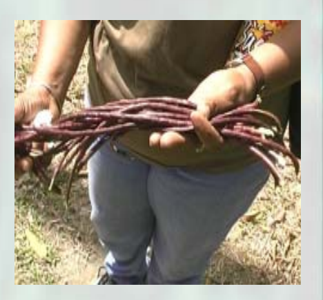
Figure 23. Purple coloured bora pods for specialty markets.

However, some markets prefer longer pods of up to 76 cm (30 inches). Pod length is significantly influenced by vigor of the plant and cultivar. Highly vigorous plants may produce pods of 90 cm (35 inches) in length. Highest quality pods are straight, crisp, and uniform in colour (Figure 22). The most popular cultivars have a green colour, although specialty markets may prefer cultivars which produce a reddish-coloured pod (Figure 23).