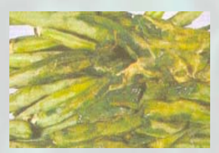
Figure 38. Slimy rot symptoms of bacterial soft rot.

weakened by injury, sunscald, chilling injury, or fungal attack. Soft rot rapidly develops in warm, moist storage environments. Pods become soft, slimy, and foul smelling (Figure 38). Control of this disease is obtained by careful harvesting and handling practices to prevent wounding of the tissue, avoiding postharvest fungal growth, and maintenance of the pods at 5°C during transport and distribution to market.