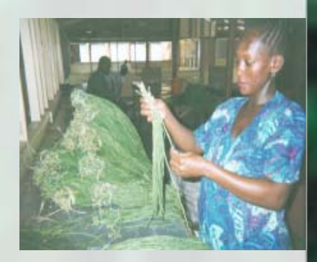
Figure 26. Harvested bora spread on a flat table for easy inspection and cleaning.

by spreading the pods out in a shallow layer on top of a clean, flat surface (Figure 26). Spreading bora pods out on a flat surface helps to dissipate field heat before packing. Any pod found with a stem longer than 1 cm should be re-trimmed to a shorter length. Bora should be cleaned by removing any leaves, stems, broken pods, blossom remains, insectdamaged, or partially decayed pods.