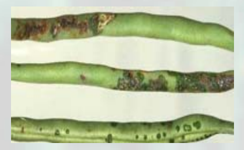
Figure 39. Severe infection of halo blight.

disease is most commonly observed on pods harvested during the rainy season. Symptoms first appear as tiny, water-soaked pinpricks on the surface. These gradually enlarge and appear as small greasy spots scattered on the pod (Figure 39). The spots eventually darken, appear sunken, and sometimes a whitish ooze is emitted from the center. Development of halo blight is rapid under ambient temperatures. Control of this disease is obtained by planting disease-free seed, avoiding harvest when the pods are wet, and holding the bora at 5^{\circ}C(41^{\circ}F) .