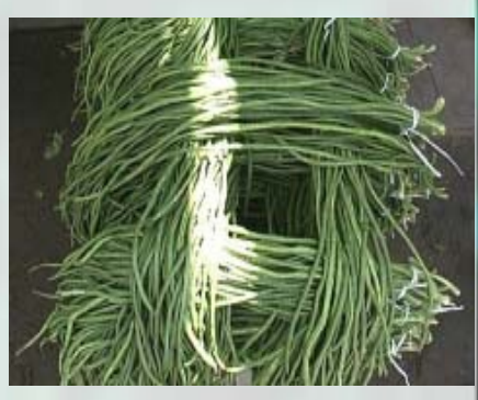
Figure 32. Bunches of bora should be loosely packed inside fiberboard cartons for export.

Well-ventilated fiberboard cartons provide more protection and are recommended, especially for export. Bora should be loosely packed within the carton to allow for adequate heat dissipation (Figure 32).