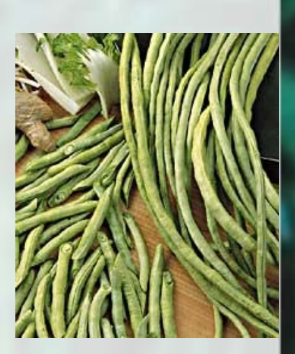
Figure 24. Slightly bulged pods with acceptable diameter for harvest.

Harvesting should be done during the coolest time of the day, which typically is in the early morning. However, picking should not begin until the moisture on the plants has evaporated. Harvesting after the pods have dried will help prevent the spread of postharvest diseases and will result in less contamination by dirt and debris. Avoid harvesting in the afternoon, as the pods will be the least swollen at this time. Harvest frequency should be every other day or every third day, depending on growth rate of the pod. The harvest container should be well-ventilated and not contain more than about 10 kg (22 lbs) of pods in order to avoid over-heating. Once harvested, bora should be protected from direct sunlight. Heat increases pod respiration rate, which is already relatively high after harvest.