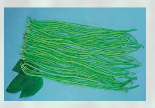
Figure 29. High quality pods are long and straight with a uniform green colour.

Bora is typically wrapped in bunches for marketing (Figure 30). Exporters prefer to purchase bora in larger bunches of 350 individual pods, while domestic markets prefer smaller bunches.