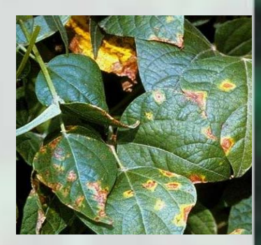
Fig 11. Symptoms of bacterial common blight