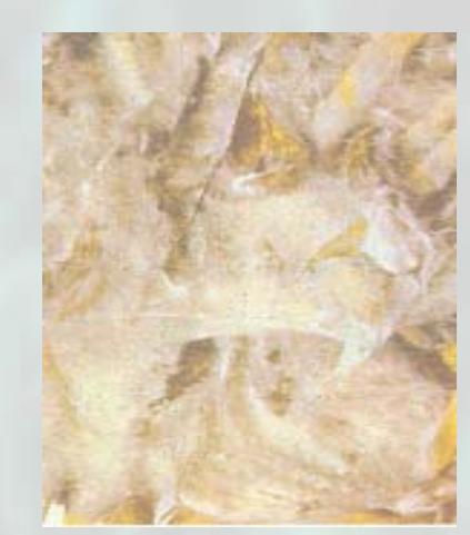
Figure 34. Severe infestation of Rhizopus rot forming a nest of mould growth.

Gray mould, caused by the common soil-borne fungus Botrytis cinerea , causes dark spotting on the