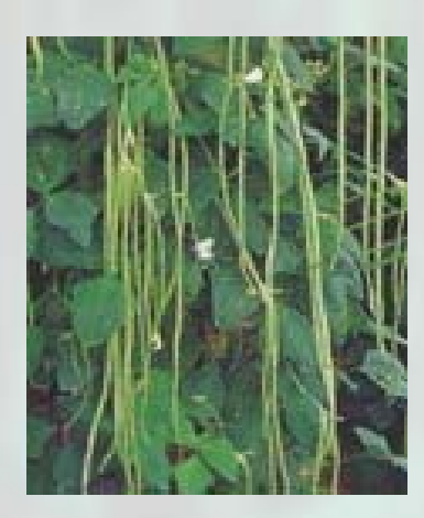
Figure 22. Long, straight dark

Bora is harvested at an immature stage, prior to full development of the seeds and pod. The initial harvest maturity can be estimated by counting the number of weeks after planting. Bora requires about 7 weeks from seeding until the start of harvest, depending on cultivar and environmental conditions. The harvest period typically continues over a period of about 6 to 8 weeks. Pod length and pod diameter are the two principal indices of harvest maturity. Pod diameter is more closely related to edible quality than length. Bora is typically harvested when the pods have reached a minimum length of 38 cm (15 inches).