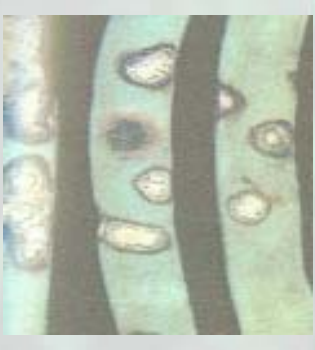
Figure 37. Anthracnose lesions on pod surface.

pods may appear healthy at harvest but undergo rotting during transit and marketing. Initial disease symptoms appear as dark specks or blotches on the pod surface. Individual lesions may become sunken and are typically gray or black in the center (Figure 37). They may coalesce and discolour much of the pod. Wounds and skin damage predispose the pod to infection. The optimal temperature for anthracnose development is 25^{\circ}C ( 77^{\circ}F ). Cooling the pods to 5^{\circ}C ( 41^{\circ}F ) as soon as possible after harvest will arrest the growth of this disease.