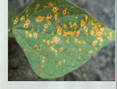
Fig 16. Symptoms of rust

• Spray with approved fungicides- Kocide or Copper Hydroxide.