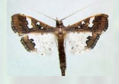
Fig 10. Larva and adult of pod borer