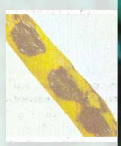
Figure 35. Dark spots on pod surface characteristic of gray mould.

surface of the bora pod (Figure 35). An obvious growth of graycoloured mould will eventually cover the infected areas of the pod. Control of this disease is obtained by a combination of pre-harvest fungicide sprays, removal of infected crop debris, careful handling practices to avoid damage to the pod surface, and prompt cooling to 5°C (41°F).