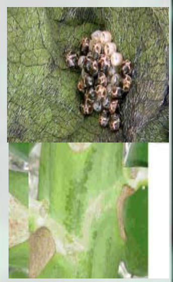
Fig 7. Adult and nymphs of bug

Leaf miner is the most important insect pest of bora, and may affect the crop from germination through to harvest. Severe infestations lead to premature leaf fall and rapid decline of the crop. The name "leaf miner" is derived from the manner in which the larva feeds, and "Chinee writing" the result of feeding (Figure 8). The larva feeds between the leaf surfaces resulting in serpentine trails (Chinee writing). The pest is prevalent during dry season thus moisture stress may aggravate the infestation and contribute to a faster decline of the crop.