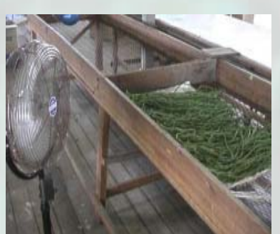
Figure 27. Cleaning of bora in properly sanitized wash water for the Barbados market.

27). In this case, bora should be submerged in clean water adjusted to a pH of 6.5 and sanitized with 150 ppm hypochlorous acid. Household bleach is the most convenient source of hypochlorous acid and is widely available in a 5.25% solution. Following the washing treatment, the bora pods should be air dried on a clean, flat surface before sorting and grading (Figure 28).