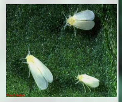
Fig 4. White flies

The pinhead size nymphs are oval and flattened, and are attached to the leaf surface until maturity. All stages of this pest can be found on the underside of leaves. Nymphs and adults feed by sucking plant sap, resulting in leaves becoming mottled, yellow and brown before dying. Feeding whiteflies excrete honey dew on leaf surface which encourages the growth of sooty mould thus hampering photosynthesis. Ants are also attracted to the honey dew. This pest is also a vector of viral diseases. The life cycle may be completed in about 28-35 days.