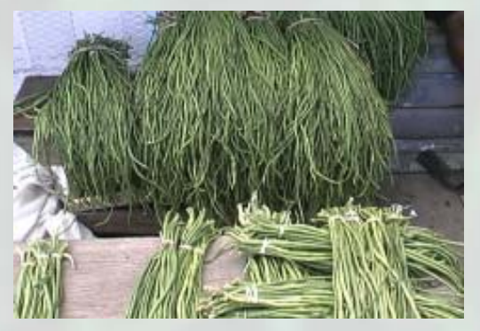
Figure 30. Bora wrapped in small bunches (foreground) for domestic marketing.