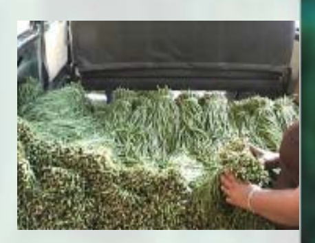
Figure 25. Bora should be transported to the packing facility immediately after harvest.

bora may lose up to 10% of its original weight. The steps in market preparation involve cleaning, sorting, and packing. The packing area should be shaded, clean, and well ventilated.