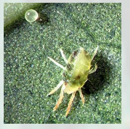
Fig 5. Egg and adult of mites